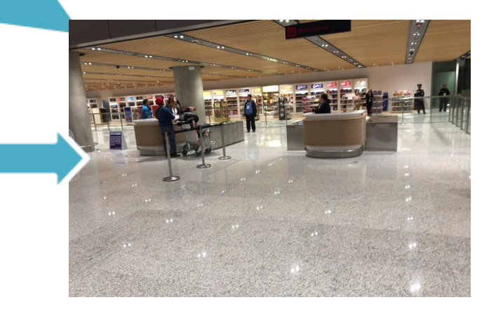
Once you pass through customs, you are finally in Cebu!

Finally, there is customs. In the direction of Customs.